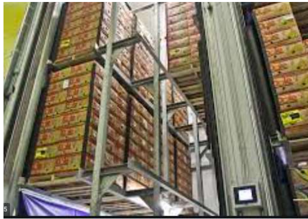
Fruit Sorting, Packing, Cold Storage Facilities