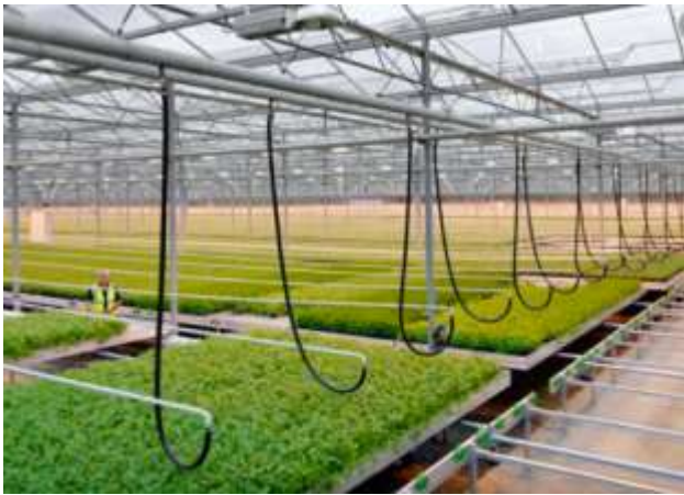
Large-Scale Modern Greenhouses